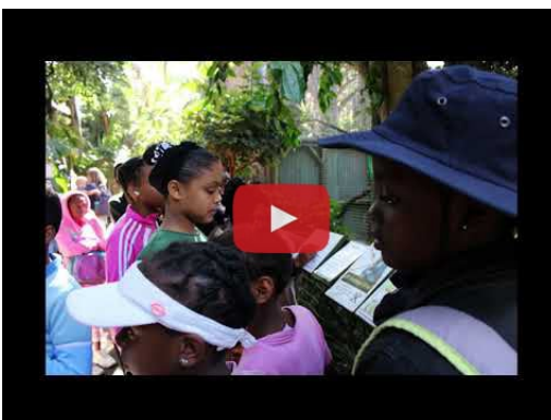
Outing to World of Birds

Thanks, as always, to Massimos for the tubs of pasta, and to Snoekies for the discounted fish and chips.