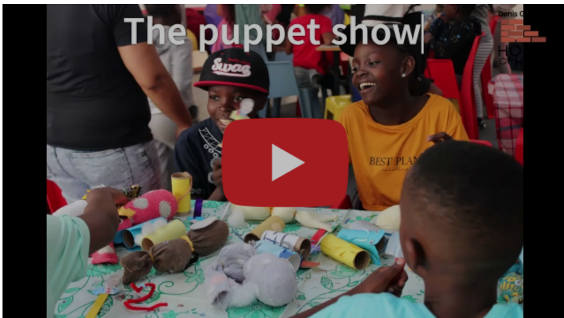
Three Day Holiday Programme

The children were delighted to see the isiXhosa version of the book in our small, but growing, library. This sparked interest in books and reading more generally and on the last day of the programme twelve children became our first borrowers.