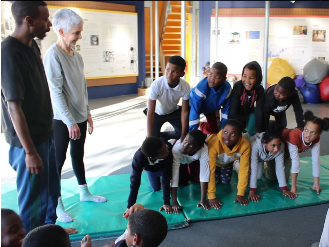
The Art of Circus (click image for video)

Our plan is that these children will both perform and listen when a German youth choir visits the DGHOH during October.