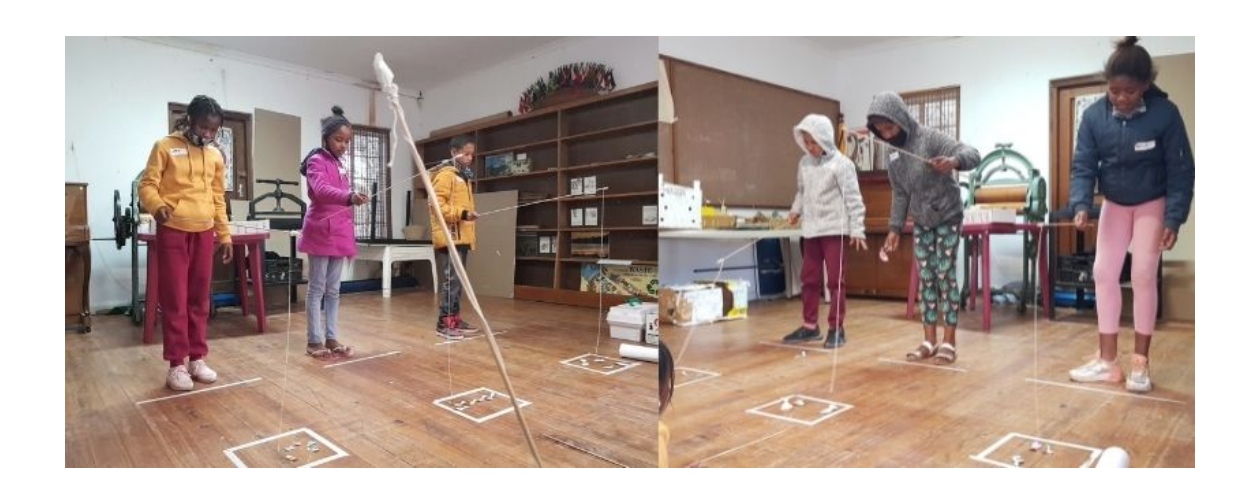
We are all multi-faceted

The most exciting part of this activity was the competition. Three children competed at a time, standing behind a chalked line on the floor, and trying to be the first to catch all five of their fish from the chalked circle in front of them. Normal fishing is generally seen as a quiet and restful activity. In contrast, our fisher-people put all their concentration into catching their prey as quickly as possible while their peers cheered them on from the sidelines.