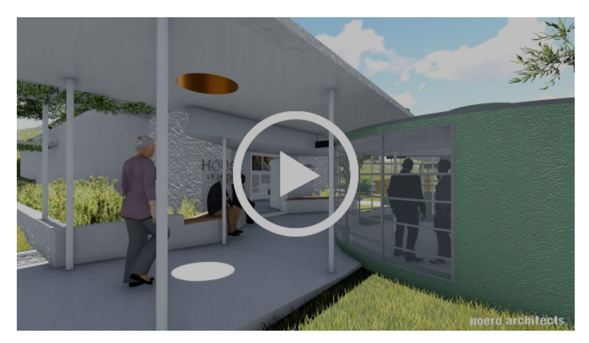
By Noero Architects

We hope that everyone will continue to support us as we take this work forward. In addition to all-important financial contributions, we would be happy to hear from you about other ways in which we can collaborate. Together we can make Life even more Wonderful!